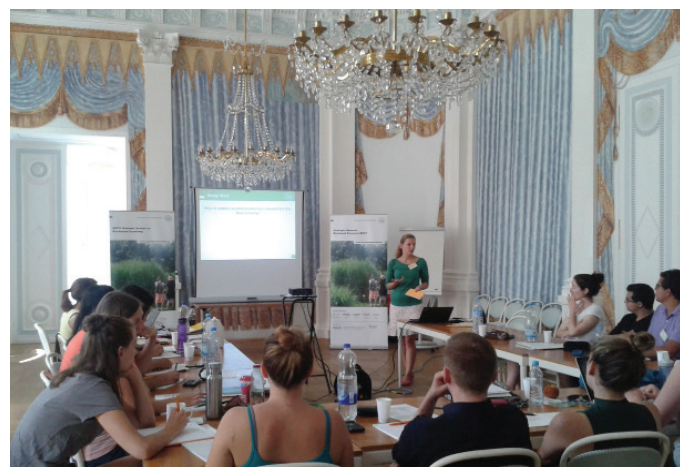
The BECY Summer School on Bioeconomy aims at giving an overview about current bioeconomic topics.

In a three week programme the BECY Summer School gives you an insight into the whole life cycle of bio-based materials: Bioenergy, Biomaterials, Biotechnology, Food Technology, as well as Ethics and Social Aspects of a future bio-based economy. Furthermore the different National Systems of Bioeconomies are part of the course.