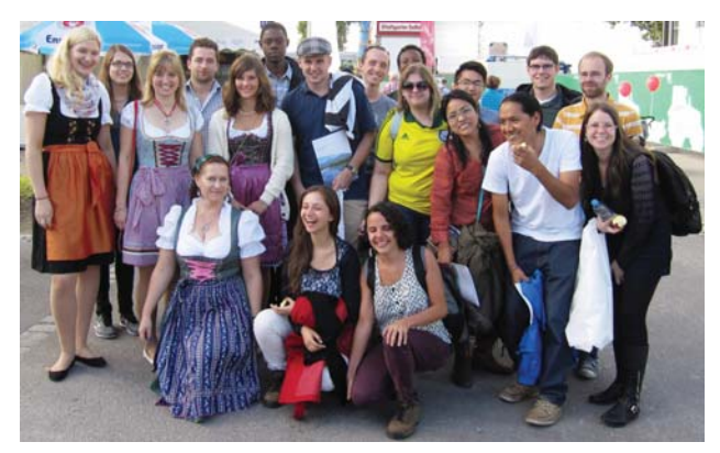
Participants and organizers of the BECY Summer School 2014